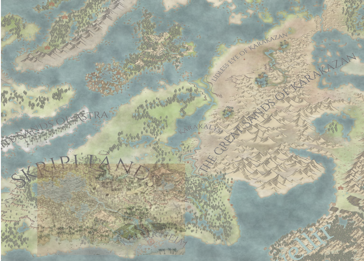
Karakazan - Karakalysi Province - Karakalysi